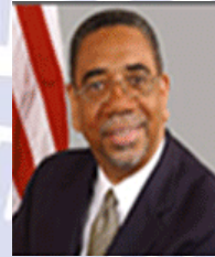
District 1 – U.S. Congressman Bobby Rush