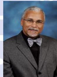
District 17 – IL State Senator Donnie Trotter